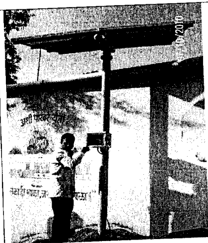
Solar based Handpump - Gram Panchayat Hivare bazar, Ahmednagar, Maharashtra 8.10.2010