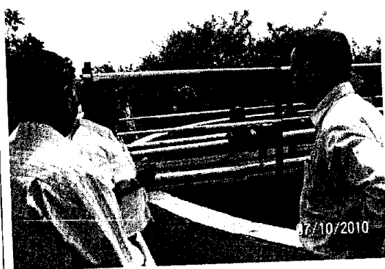
Discussion regarding drinking water source - Secretary DDW&S GOI, visit to Gram Panchayat Shirsawadi, Pune, Maharashtra - 'Aple Pani' Project 8.10.2010