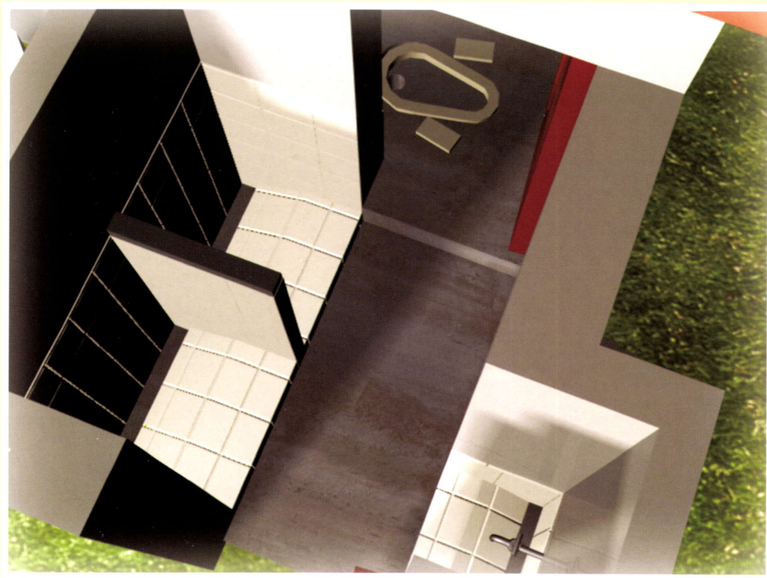
VIEW OF GIRL'S URINALS

शुद्ध जल की है पहचान, स्वस्थ शरीर और स्वस्थ ज्ञान